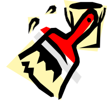
Paint the House